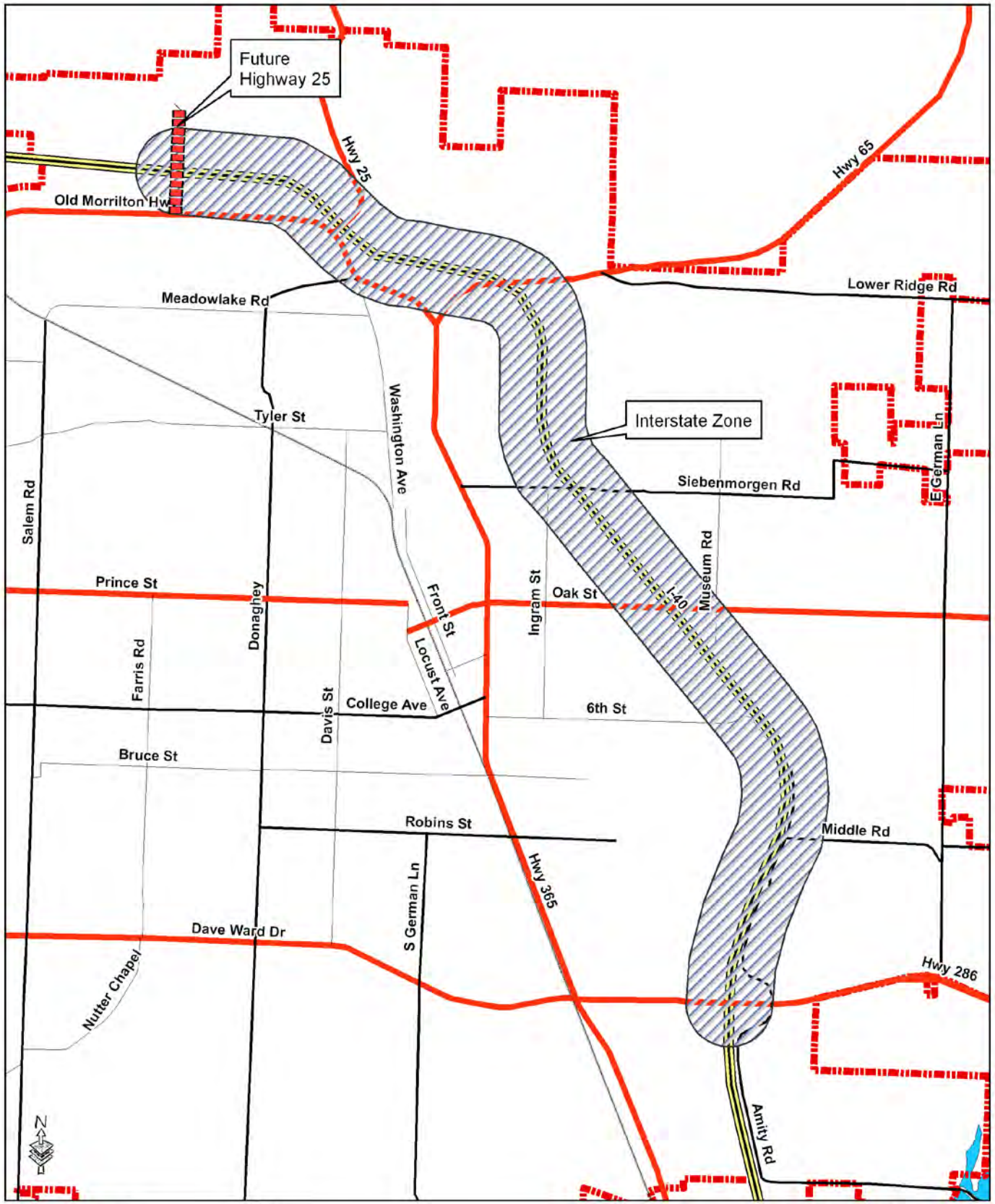
Interstate Sign Zone Appendix A